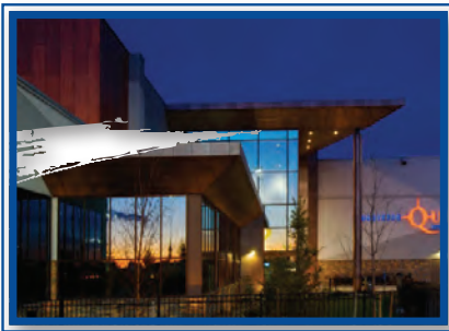
Northern Quest Resort & Casino

Approx. 7-8 pesticide credits will be provided over two days. (Plus essential non-accredited Safety Seminar on Wednesday and supplier/maintenance info throughout the conference.)